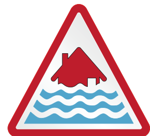
Severe Flood Warning

Flooding is expected. Immediate action required.