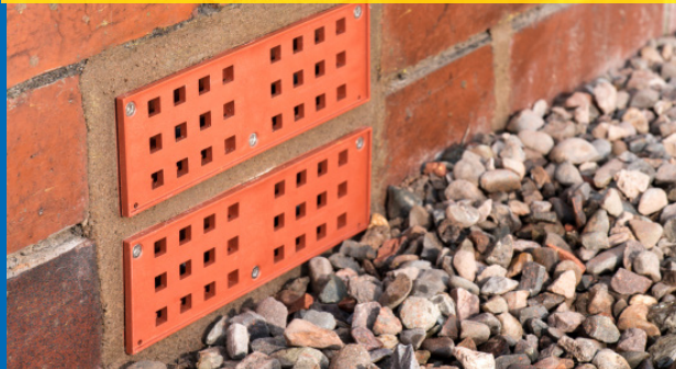
Self Closing Air Brick