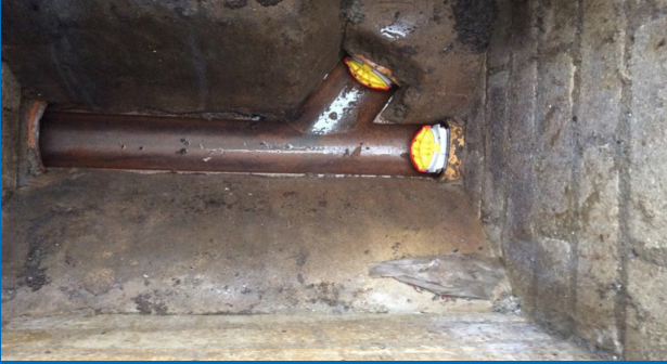
Non-Return Valve for main drain runs